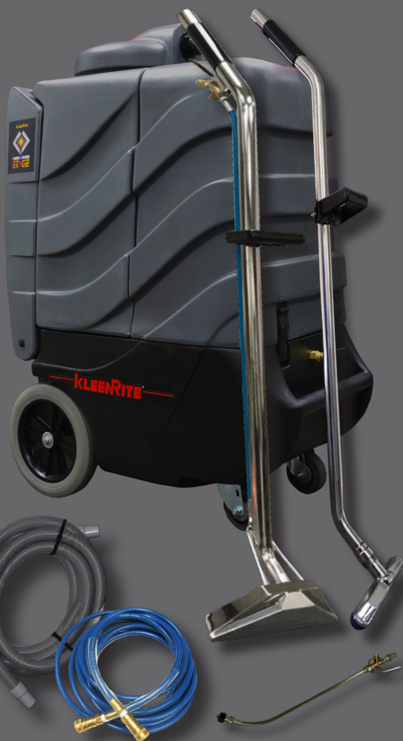
High Pressure Edge Complete All Surface Package